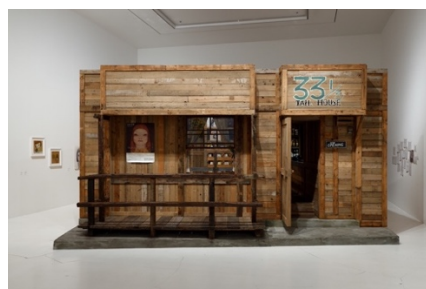
Recreation of the Rock Café “33 1/3”, Installation view of “Yoshitomo Nara: The Beginning Place” (Aomori Museum of Art, 2023-2024) Collection of Yoshitomo Nara Foundation