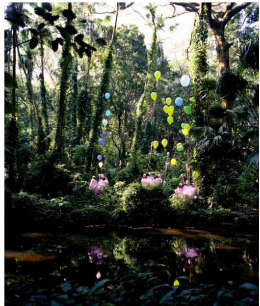
Janaina TSCHÄPE, Xicletiformis Pluralis , 2005 Collection of Taguchi Art Collection ©Janaina Tschäpe Courtesy of nca | nichido contemporary art

The world today is drenched in conflict and division, sparked by fear of things and others beyond our understanding. Some of these endless troubles, like wars, occur at the level of nations, while others lurk in writing on the internet, or in trifling conversations at school or workplace as we go about our usual routines. Facing daunting difficulties that make daily life a struggle, we embark on various courses of action. These might include communing with those around to make the place we live a better place; changing how society works so that people who think differently, can coexist in the same place; traveling or relocating to learn different ways of thinking, and acquire different wisdom; and when all else fails, becoming migrants or refugees, and fleeing. Such are the ways we use to gain happiness, and encountering a safe haven and like-minded souls, and finding our true self, may well be the reason we were born into this world.