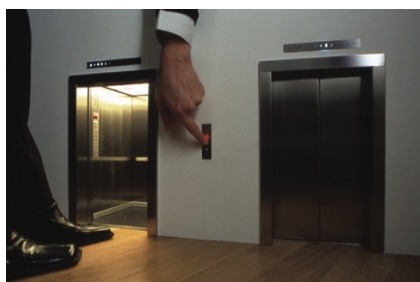
Maurizio CATTELAN, Untitled (Elevator) , 2001 Collection of Taguchi Art Collection and Taguchi Art Foundation

*Kindly make inquiries to the Hirosaki Museum of Contemporary Art PR Office for the press images in general.