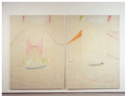
SUGITO Hiroshi, Dancing Man , 2007 Collection of Taguchi Art Collection and Taguchi Art Foundation © Hiroshi Sugito, Courtesy of Tomio Koyama Gallery Photo: Shigeo Muto