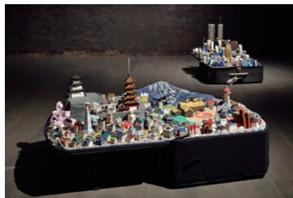
YIN Xiuzhen, Portable City : Hirosaki , 2020, Collection of Hirosaki Museum of Contemporary Art ©Yin Xiuzhen Photo: Naoya Hatakeyama