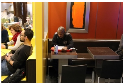
TAKAYAMA Akira / Port B, McDonald's Radio University , Frankfurt, 2017 Collection of Taguchi Art Collection and Taguchi Art Foundation